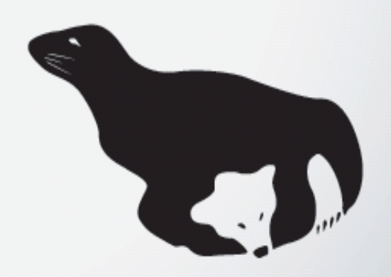
Do you see a seal or a polar bear?