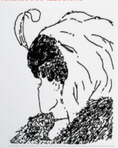
Do you see a young woman or an old woman?